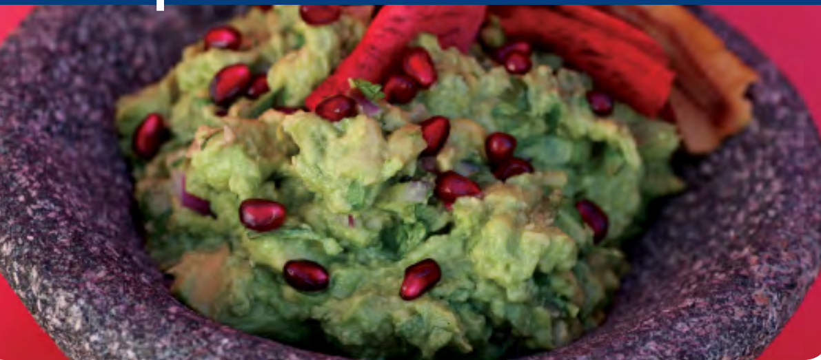
Give your guacamole visual and flavor distinction by stirring in fresh pomegranate arils.