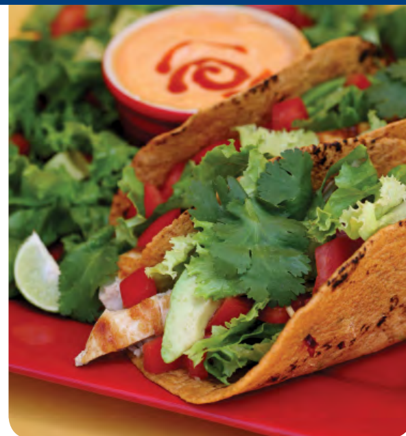
Everyone loves tacos, most especially kids—pack with healthy fresh produce in whole-wheat tortillas