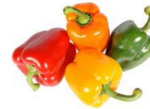
bell peppers green/red

Prices have stabilized. The Flora Loca harvest is fully underway; yields continue to increase. RSS Avocado Chunks, Halves, Pico de Gallo Guacamole, and Pure Pulp are available.